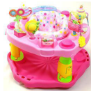
Evenflo Exersaucer 800-233-5921