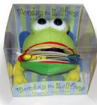
Monday the Bullfrog Plush Books 800-732-9531